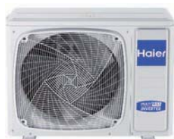
1:5 5U90S2SS2FA 5U105S2SS3FA