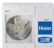
1:4 4U75S2SR2FA 4U85S2SR2FA