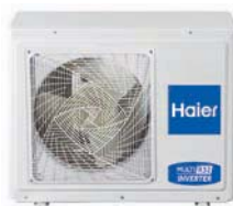
1:3 3U55S2SR2FA 3U70S2SR2FA