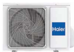
1:2 2U40S2SM1FA 2U50S2SM1FA